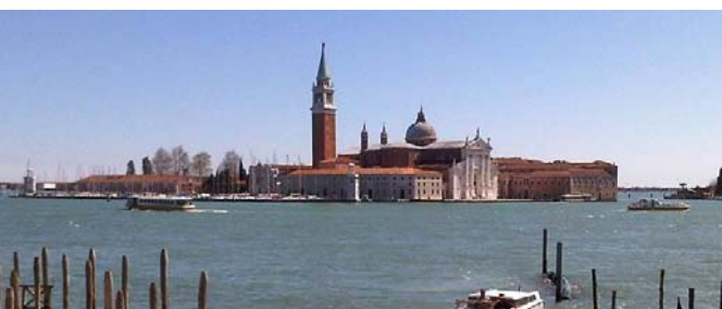
Left: San Giorgio Maggiore from the hotel.