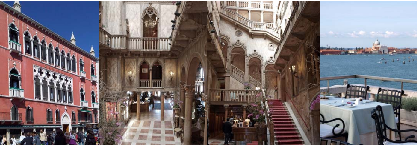
Left to right: The exterior and impressive main staircase at the Danieli Hotel and the view at breakfast

If you still need any encouragement to attend the 2012 Annual Meeting, perhaps these photographs will provide the necessary stimulus!