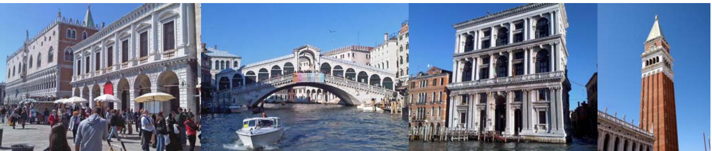
Left to right: The Doge's Palace, Rialto Bridge, a Grand Canal villa and the Campanile San Marco