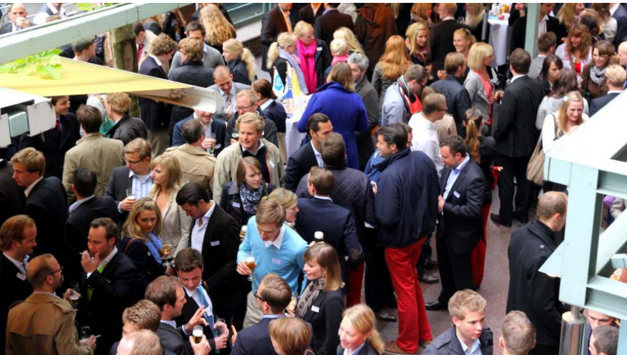
Just some of the 1,200 guests attending the Young Shipbrokers' event in Hamburg